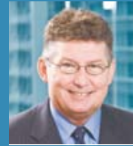
JOHN MULLINS EDITORIAL

There is obviously no substitute for having your Will properly signed and witnessed so the estate does not incur unnecessary expense applying to the Court for a determination as to whether a Will is valid.